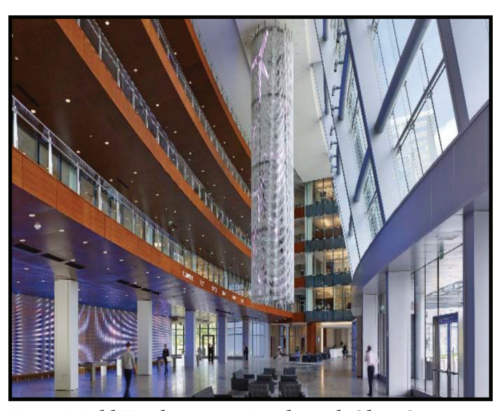
Eaton World Headquarters, Beachwood, Ohio. Over 500 doors, frames and hardware package. Provided Millwork installation for Millwork provider as second tier contractor.